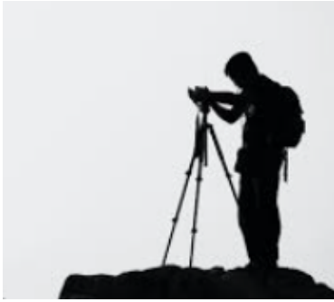
Our Last Club Photo Shoot