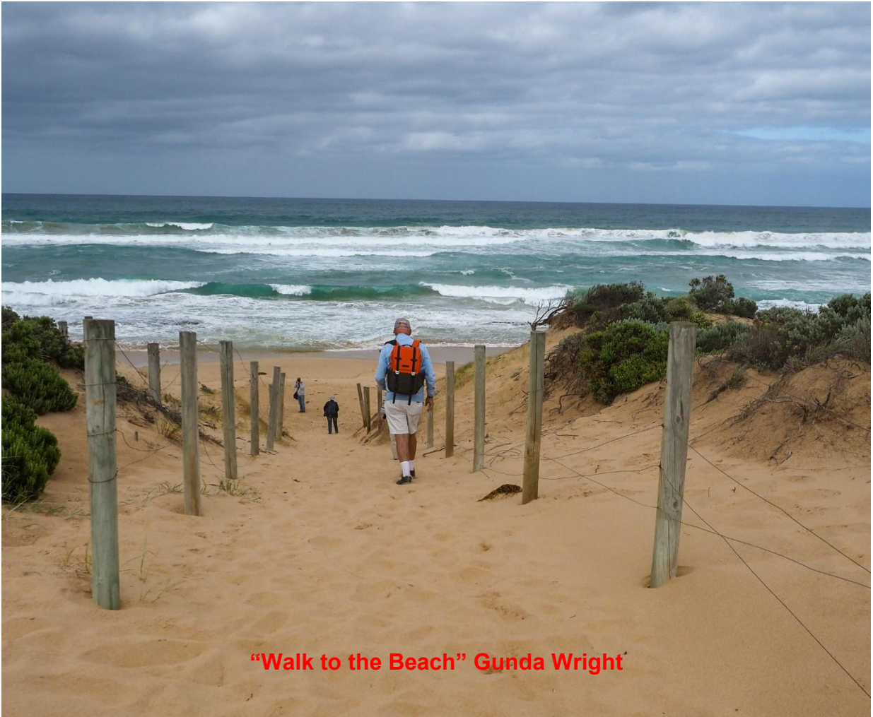
“Walk to the Beach” Gunda Wright