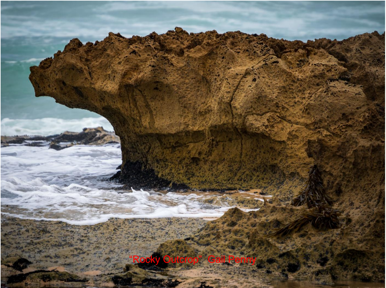
"Rocky Outcrop" Gail Penny